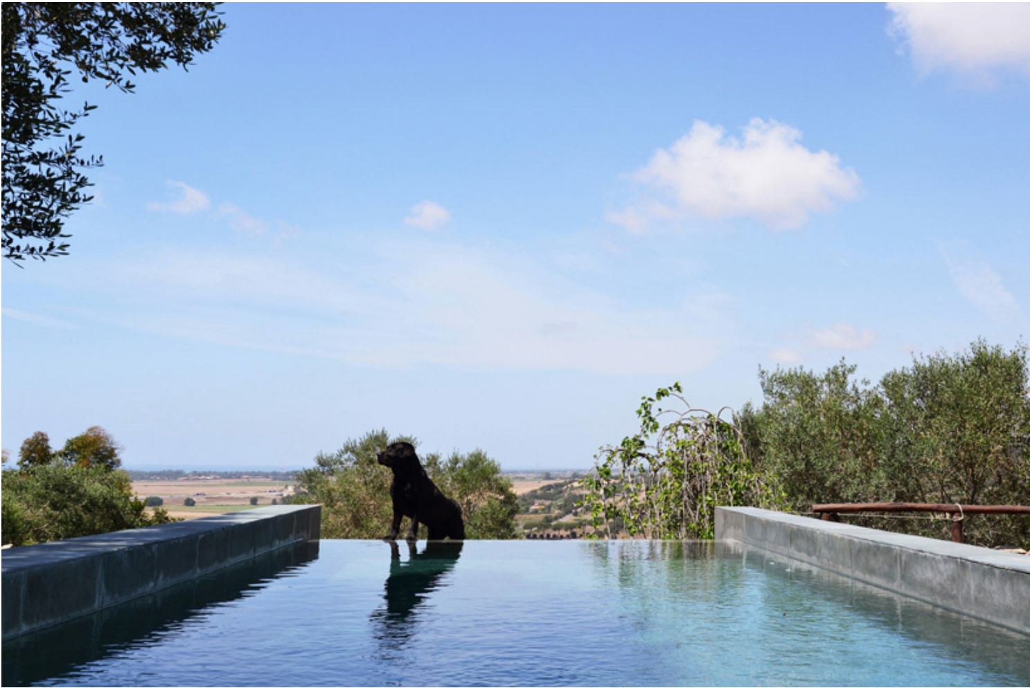
two stone walls channel views across the rural lazian landscape