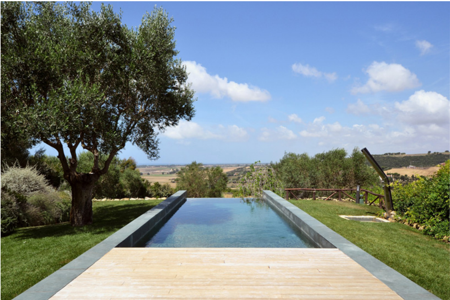
the intervention is designed to be a machine for observing the landscape