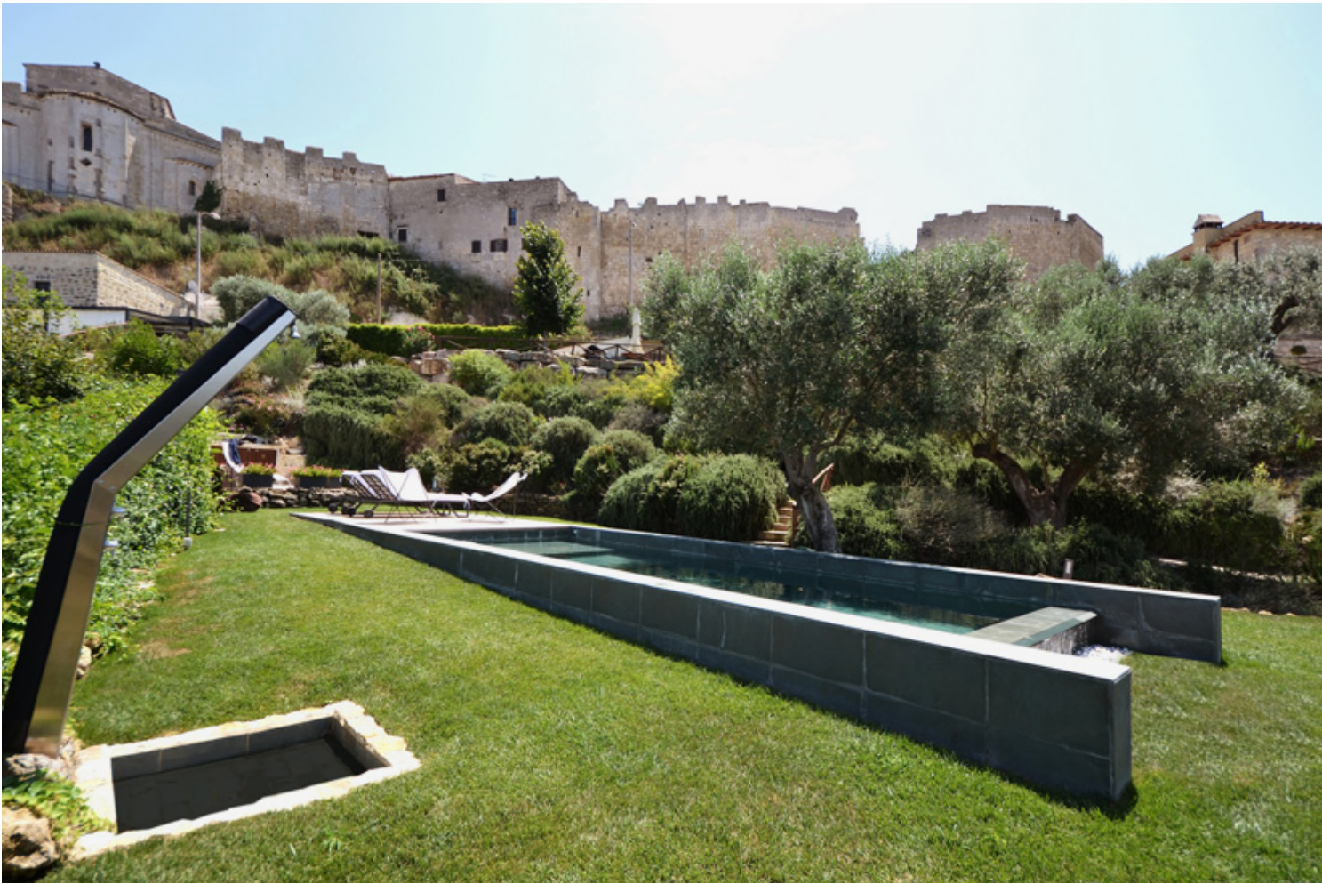
the shape of the pool is reminiscent of vernacular structures built to hold natural spring water