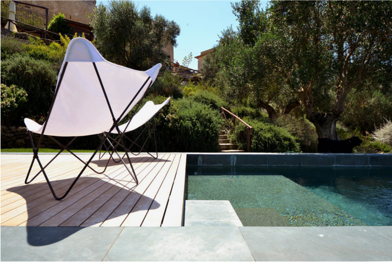
the project intends to create a space that exists in harmony with nature