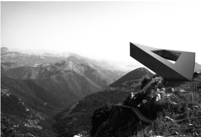
villae minimae #4

thematically, the structures have a provocative and autonomous approach. aesthetically, they are based on the distortion of a simple geometric figure, where each manipulation corresponds to a panoramic view from within the interior space, framing nature and allowing for contemplation of the landscape. this characteristic underlines the iconography of the concepts: the dichotomy between nature and edifice.