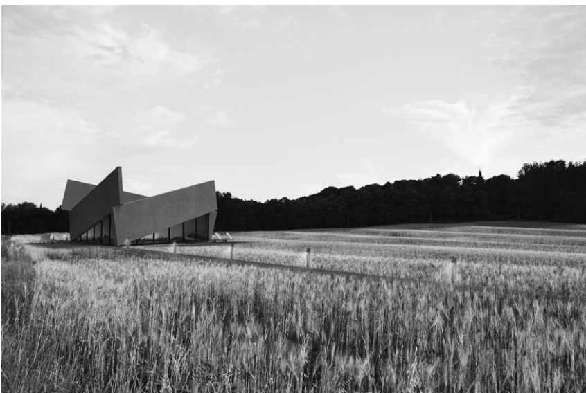
villae minimae #2