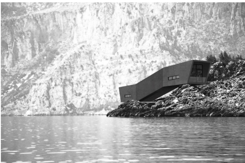
villae minimae #3