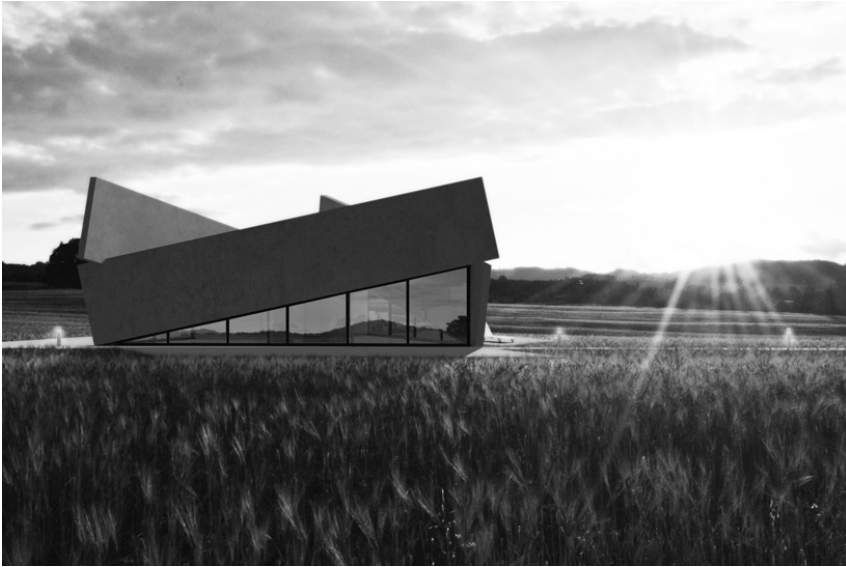
villae minimae #2

designboom has received this project from our ‘DIY submissions’ feature, where we welcome our readers to submit their ow