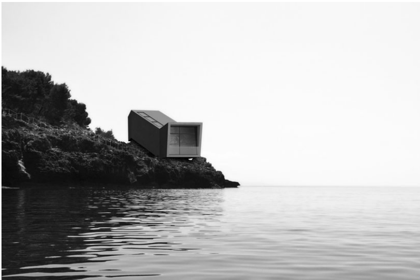
villae minimae #3