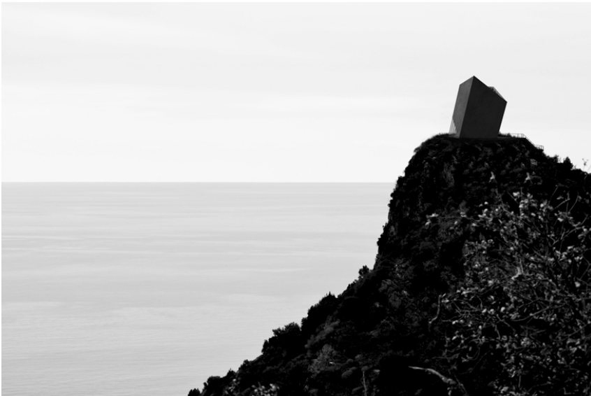
villae minimae #1