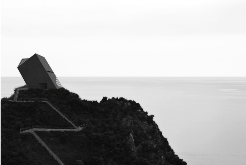
villae minimae #1