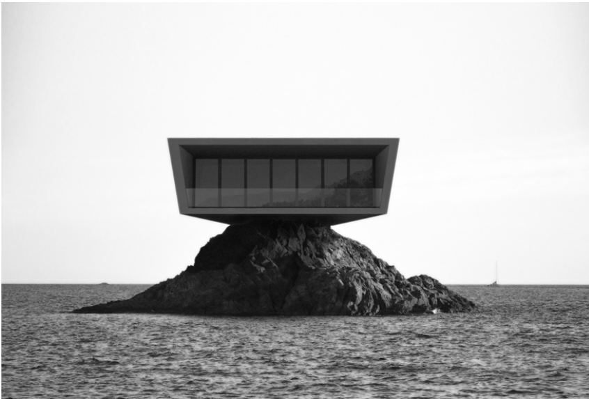
villae minimae #5

thematically, the structures have a provocative and autonomous approach. aesthetically, they are based on the distortion of a simple geometric figure, where each manipulation corresponds to a panoramic view from within the interior space, framing nature and allowing for contemplation of the landscape. this characteristic underlines the iconography of the concepts: the dichotomy between nature and edifice.